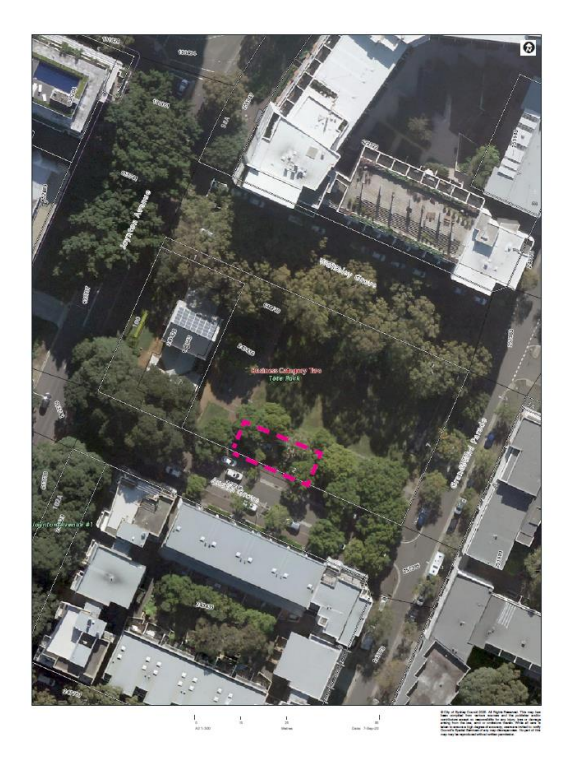
General Arrangement Plan - TOTE PARK